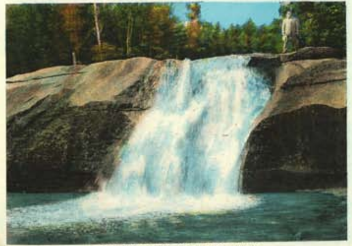
DIANA'S BATHS, WHITE MTS., N. H.