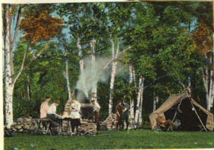
"OUT IN THE OPEN," CAMPING IN THE WHITE MOUNTAINS, N. H.