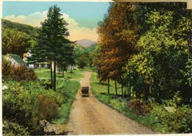
ROAD TO BEMIS, CRAWFORD NOTCH.