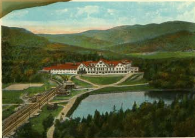
CRAWFORD HOUSE AND LAKE, MT. WASHINGTON HOTEL IN THE DISTANCE.