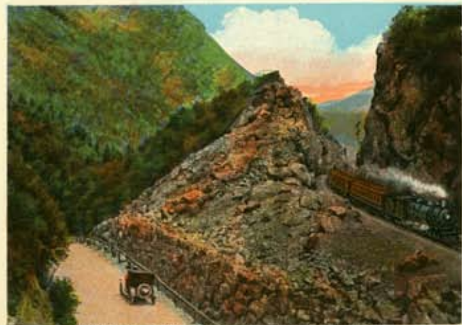
GATEWAY TO CRAWFORD NOTCH BY ROAD AND RAIL.