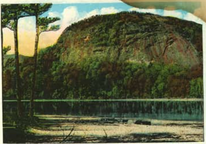
ECHO LAKE AND WHITE HORSE LEDGE, NO. CONWAY, N. H.