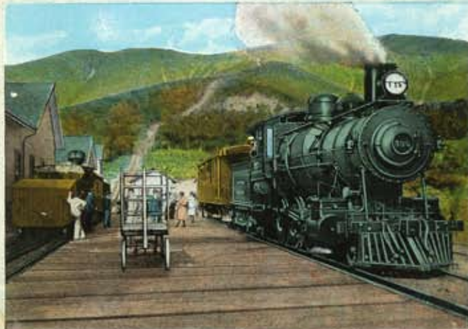
TRAIN AT BASE OF MT. WASHINGTON.