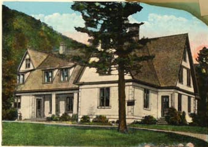
NOTCHLAND—THE INN UNIQUE—CRAWFORD NOTCH. AT BEMIS, WHITE MOUNTAINS, N. H.