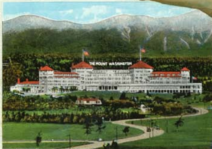
MT. WASHINGTON HOTEL AND PRESIDENTIAL RANGE, BRETTON WOODS.