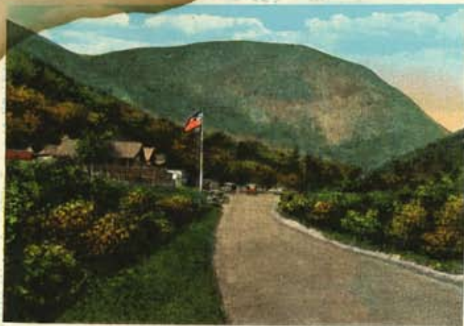
MT. WILLARD AND WILLEY HOUSE CAMPS, CRAWFORD NOTCH, N. H.