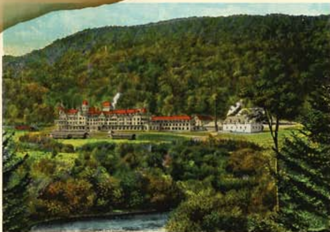
THE MOUNT PLEASANT, WHITE MTS., N. H.