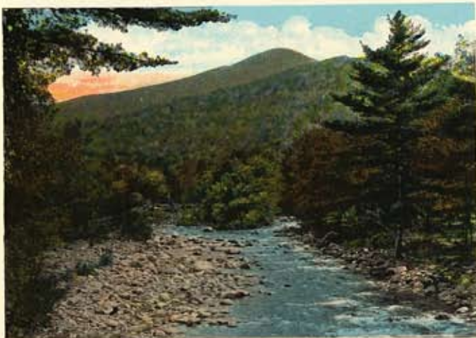
IN THE BEAUTIFUL CRAWFORD NOTCH.