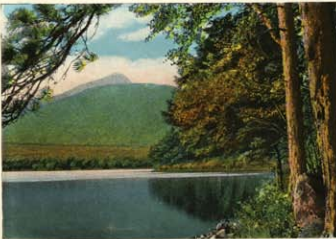
CHOCORUA MOUNTAIN AND LAKE, WHITE MTS., N. H.