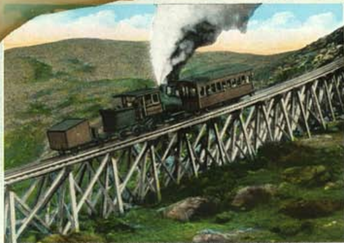
MT. WASHINGTON R. R. OVER JACOB'S LADDER, MT. WASHINGTON.