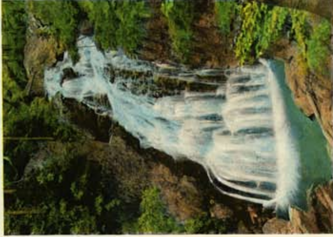
CRYSTAL CASCADE, PINKHAM NOTCH, WHITE MTS., N. H.