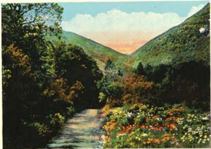
IN THE BEAUTIFUL CRAWFORD NOTCH.