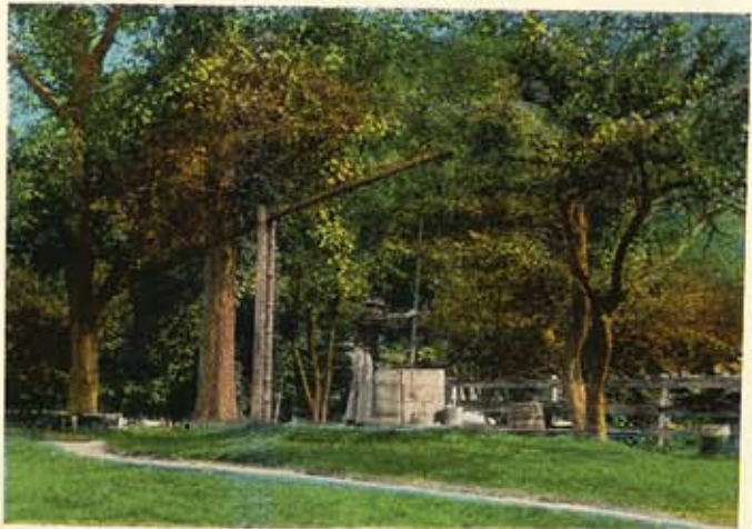
THE OLD OAKEN BUCKET.