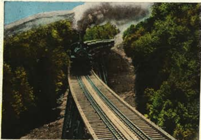
M. C. R. R. TRAIN CROSSING FRANKENSTEIN TRESTLE.