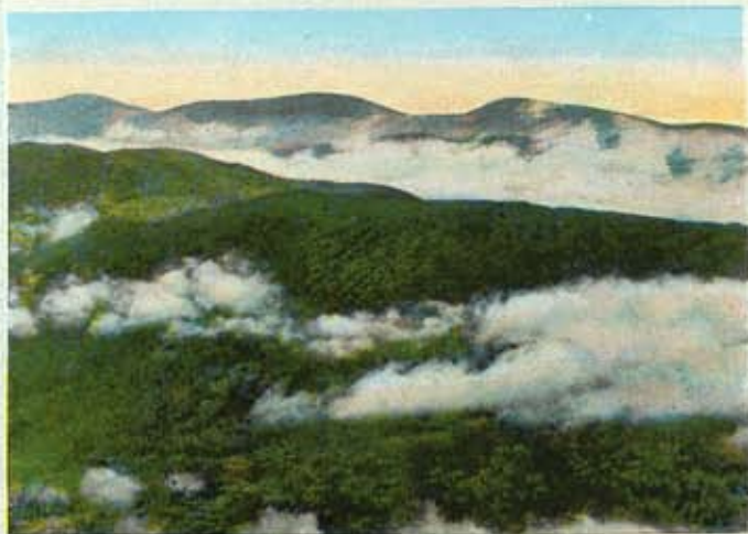
ABOVE THE CLOUDS, MT. WASHINGTON, WHITE MOUNTAINS, N. H.