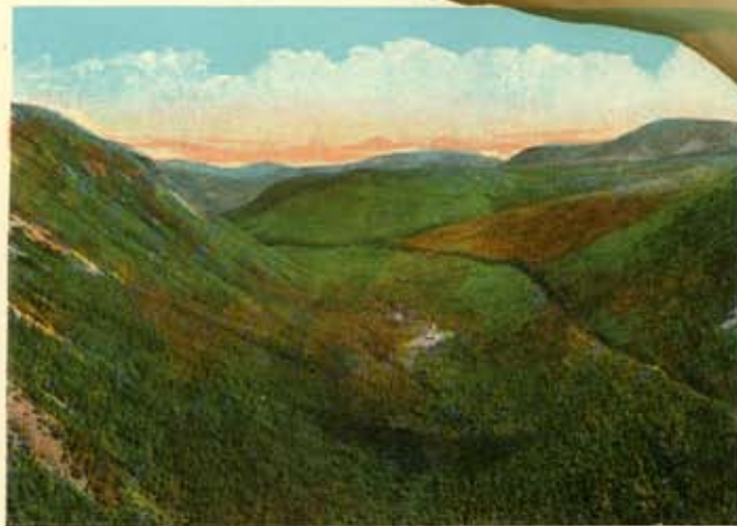
CRAWFORD NOTCH FROM MT. WILLARD.