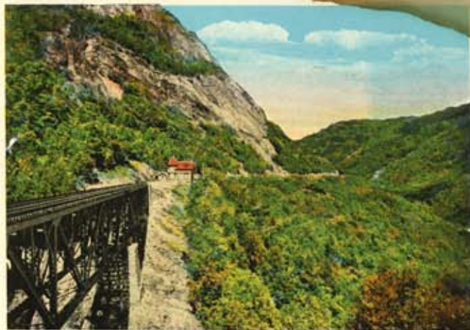
WILEY BROOK BRIDGE, WHITE MTS., N. H.