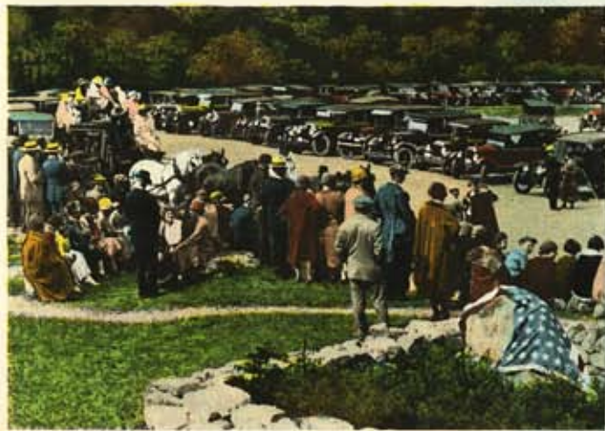
WILEY HOUSE CAMP GROUNDS, CRAWFORD NOTCH, N. H.