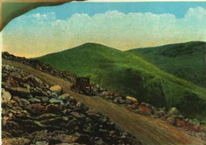
ONWARD AND UPWARD, MT. WASHINGTON, THE SWITZERLAND OF AMERICA.