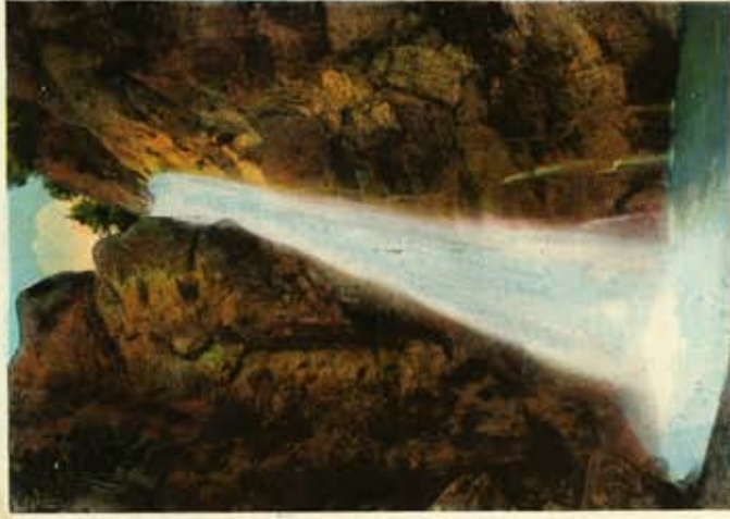
GLEN ELLIS FALLS, WHITE MTS., N. H.